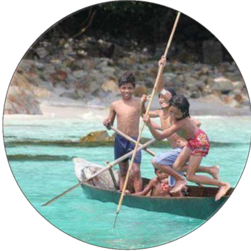
Moken ethnic group