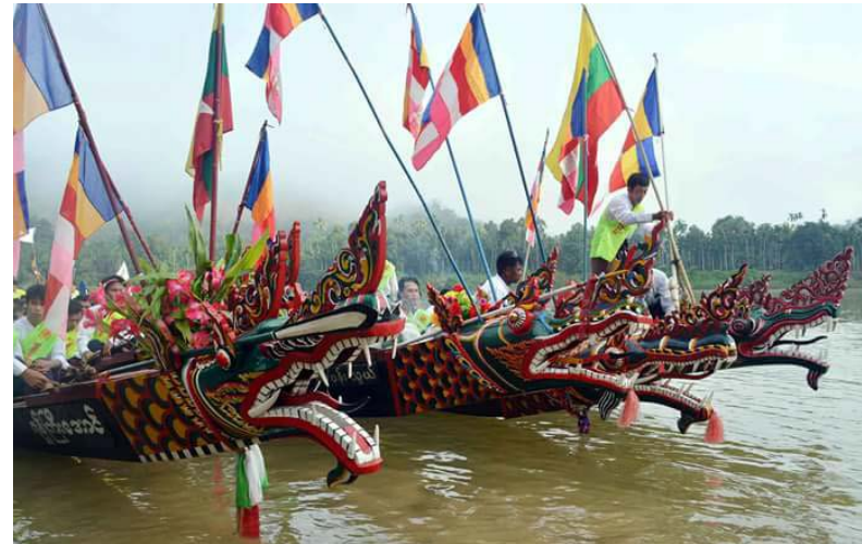
Taninthryi Dragon Boat