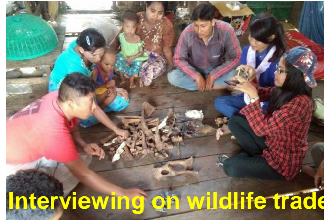
Interviewing on wildlife trade